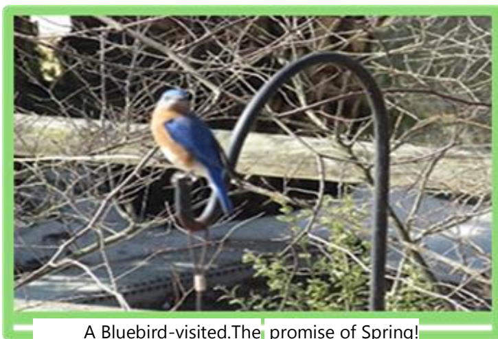
A Bluebird-visited.The promise of Spring!